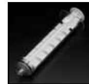
ENDOTEK Negative Pressure Syringe