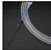
MAXXWIRE™ Guide Wire