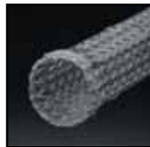
Fully Covered ALIMAXX-ES™ Esophageal Stent