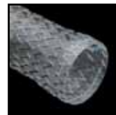
Fully Covered AERO™ Tracheobronchial Stent