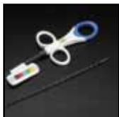
AEROSIZER™ Stent Sizing Device